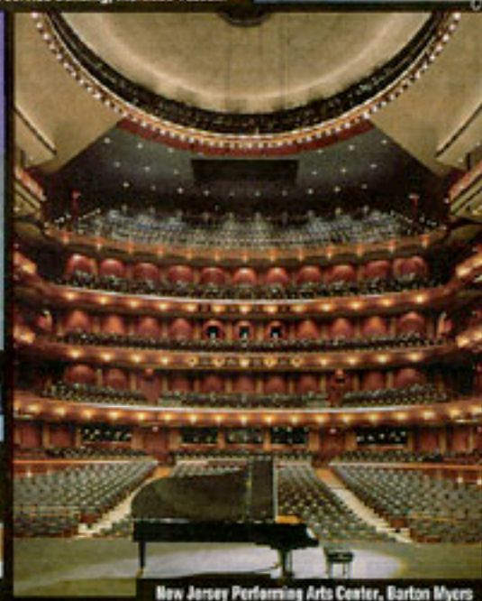
New Jersey Performing Arts Center, Barton Myers