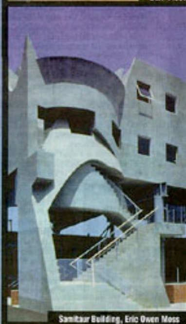
Samitar Building, Eric Owen Moss